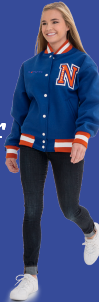
C. WOOL JACKET Quilt Lining HW5119DQ Nylon Lining Chenille: (CH25) with letter inserts (CHLI).