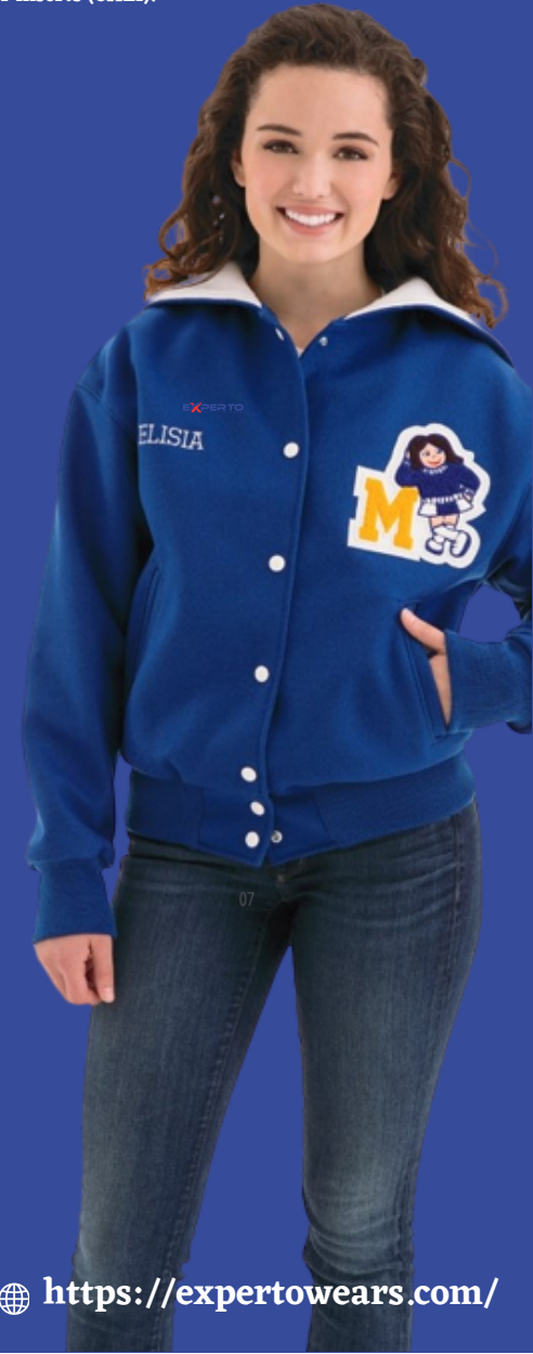
D. WOOL JACKET Quilt Lining Nylon Lining Chenille: (CH5115) and (CHCBFBL37). Monogram: (MNBSF-1) 3 /4