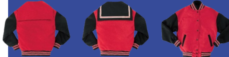
Solid Sailor Sailor with Stripe Stand Up Baseball

Add "M" to style number for solid or striped sailor and add $20 to price.