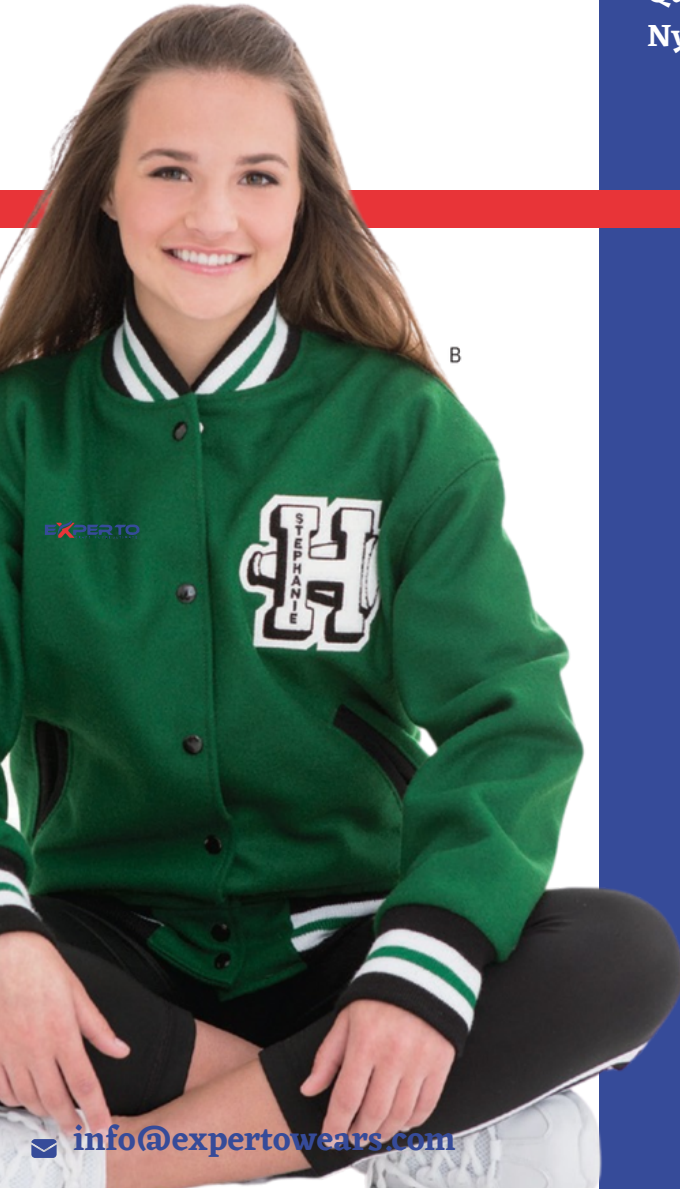
B. WOOL JACKET Quilt Lining Nylon Lining